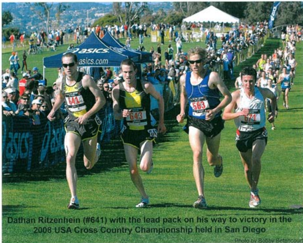
Dathan Ritzenhein (#641) with the lead pack on his way to victory in the 2008 USA Cross Country Championship held in San Diego